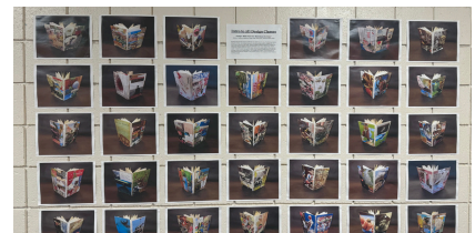
Student Artwork Display