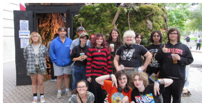
Art Club at Art Price